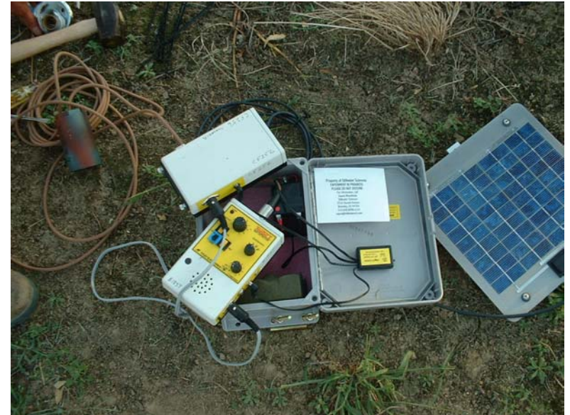
Figure 3-5. Detector deployment and setup example. (a) The Koehnan mainstem Sacramento River site. (b) Close up of detector components.